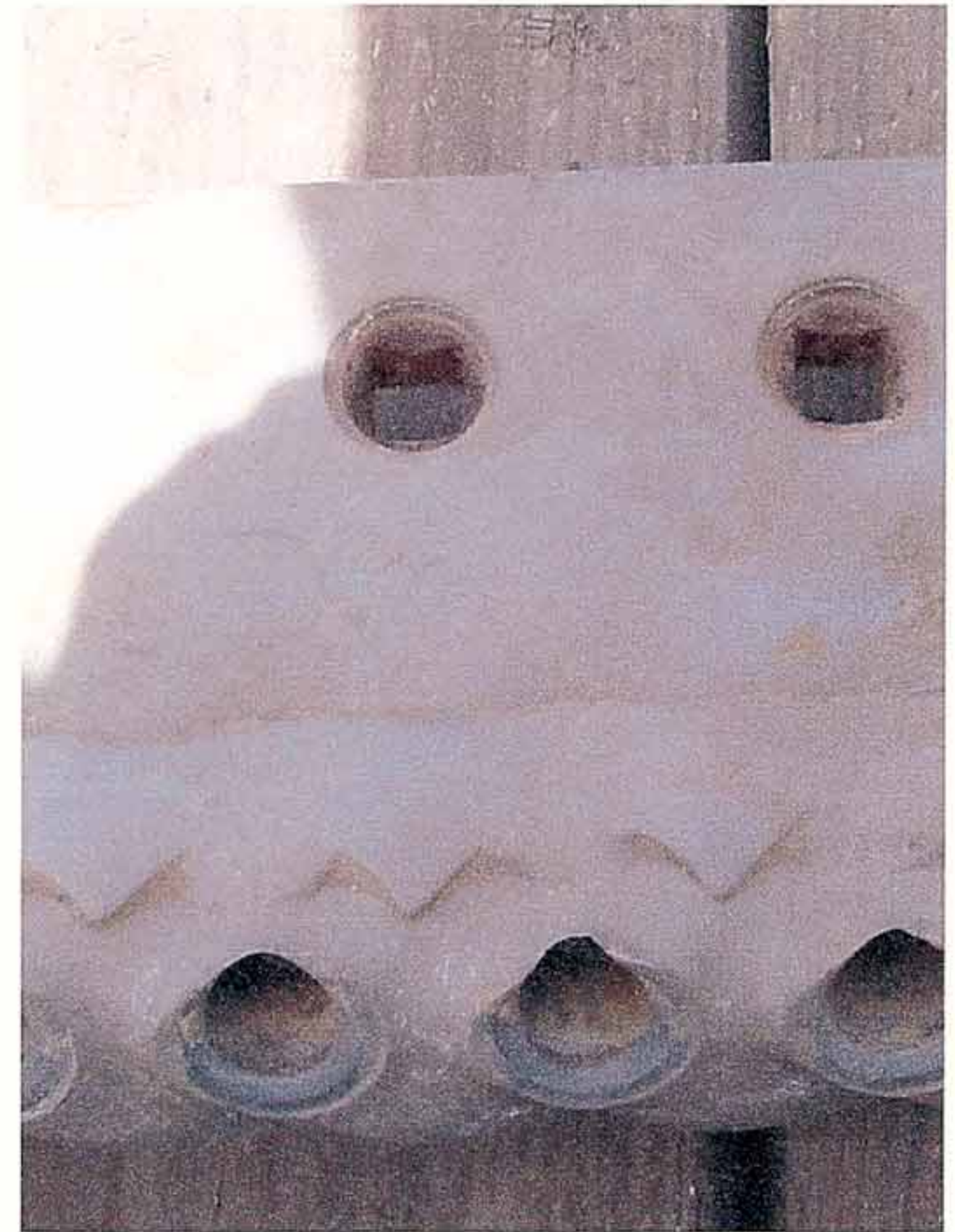
(Top Right): Tool Holder with Severe Carbide Tooth Hole Wear. (Top Left): Holes Were Rebuilt using High-Strength Welding Wire.